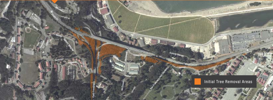
Initial Tree Removal Areas