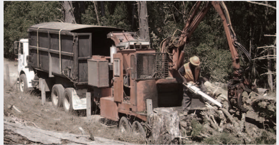
Tree removal activity and equipment.