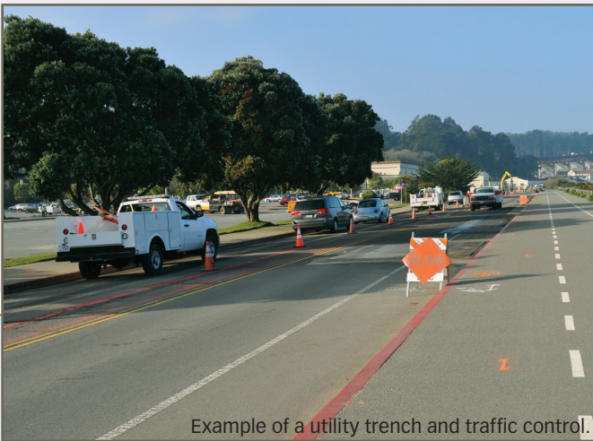
Example of a utility trench and traffic control.

Please be cautious when traveling around the construction site and follow the instructions of construction signage and traffic controllers.