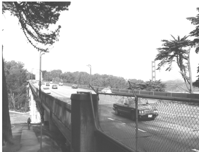
Doyle Drive with the Golden Gate Bridge in the background.

In 2004 the Maybeck Foundation nominated the Palace of Fine Arts for listing on the NRHP. The State Historical Resources Commission approved the nomination at its