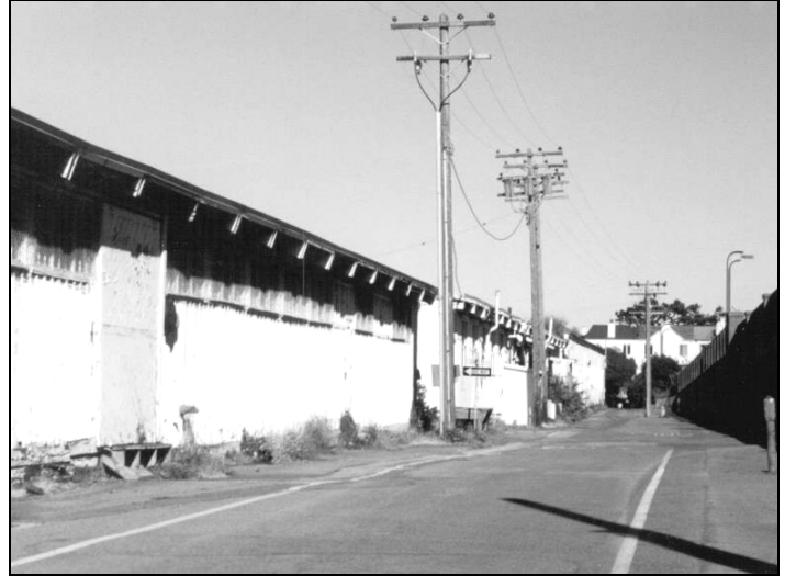
Buildings 1184, 1183, and 1182, camera facing east.

still be an adverse effect. The removal would also be an adverse effect because it would cause a loss of integrity of the edge, or boundary, of the northeast corner of the Presidio NHLD. The replacement of these warehouses to their original location after the demolition of the temporary detour structure would mitigate the loss of contributing elements and boundary erosion.