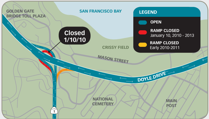
These ramp closures do not affect regional traffic coming from or going to the Golden Gate Bridge.

Early 2010-2011 closure: Off-ramp from northbound Park Presidio/Highway 1 (from 19th Avenue) to southbound Doyle Drive. The exact closure date had not yet been determined.