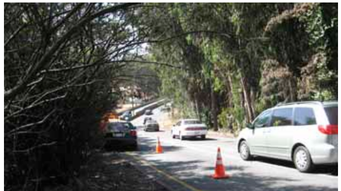
Trees encroaching on southbound Highway 1.

Construction of the new facility will begin in fall 2009. Traffic will remain on the existing Doyle Drive though early 2011 while construction occurs adjacent to the existing roadway.