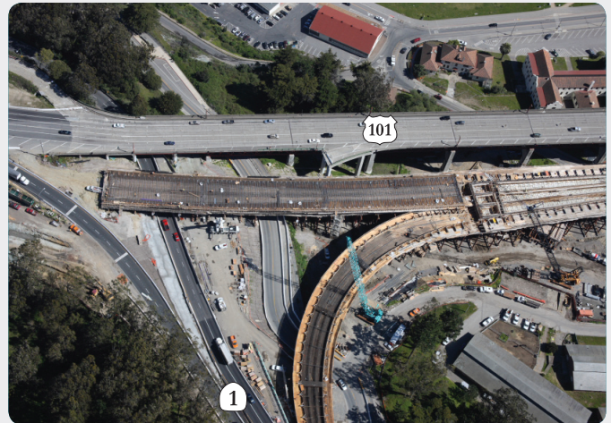
Construction of new connector ramp and high viaduct

We apologize for the inconvenience associated with this closure.